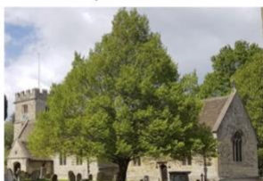
St Nicholas, Old Marston Choir

Sunday 5 th March 2023 St Nicholas Church Old Marston @ 6pm