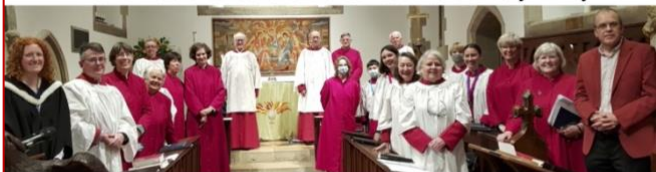
Holy Trinity, Headington Quarry Choir

With the Combined Choirs of St Nicholas and Holy Trinity