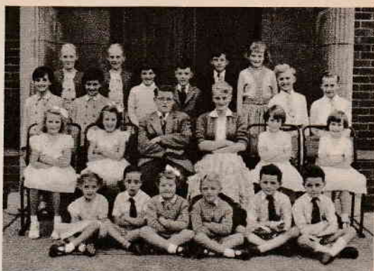
How Many Twins ?

THE age of a deceased man in a tombstone inscription in the churchyard at Llangynwyd, in Glamorganshire, is given as 7777. The reason for this astonishing statement is that the stone mason responsible for it was illiterate, was unable to carve the figures 28, and got out of it by carving four figure sevens in a row.—F. CURTIS.