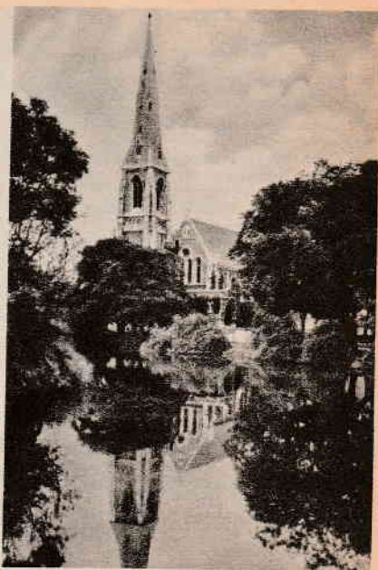
The English Church, Copenhagen

Interesting information may be gleaned from the church records. It is noted that in 1863 eight Brit-