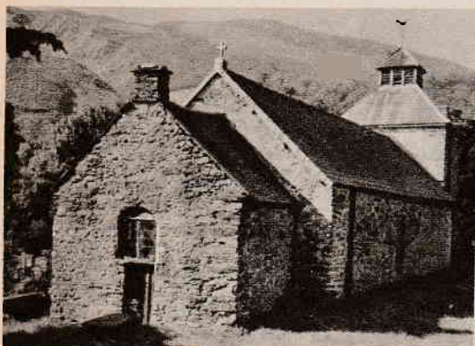
The Saint of Hares