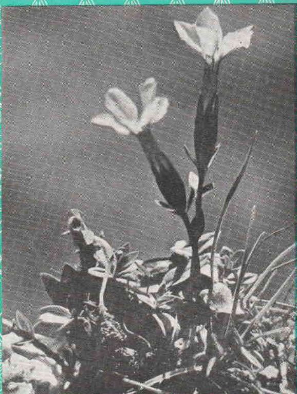
Sunshine on Alpine Flowers