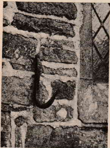
Hook outside North Wall (To hold pole for putting out fires)

The principal feature of the little church is its fine woodwork, crowned by a splendid roof of the late 15th