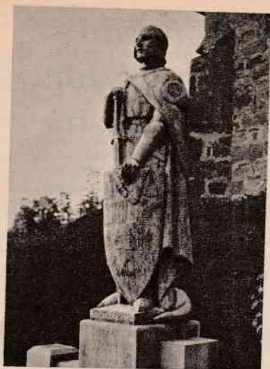
Lord Chesterfield Statue