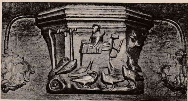
Bristol Cathedral, Fox Preaching to Geese

The more you study the subjects of these misericord carvings the more you will understand the everyday life of the ordinary man and woman of mediaeval England, and you will certainly be well rewarded for your efforts.