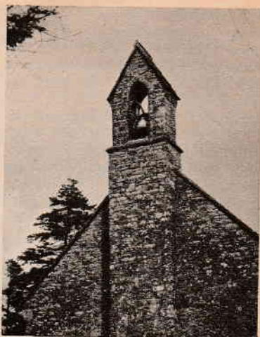
19th-Century Bell Turret

or early 16th century. The beautiful oak chancel-screen, with traceried bays and spandrels decked with roses, is of similar date. The two-decker pulpit, the font-cover, and altar rails are all of the Jacobean period. The church possesses a silver chalice of about 1660, with repoussé ornament.