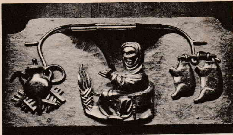
Misericord at Ludlow, Shropshire, 15th Century (Representing the Month of December)