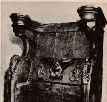
Choir Seat, Swinbrook, Oxon.

Most people will be interested in the actual subjects illustrated in these carvings. They are not always, as might be expected, of a religious nature. The majority, perhaps, have little bearing on the religion of our ancestors. Could it have been that their position was considered not dignified enough for such subjects? The carvers, not unnaturally, showed the things with which they were most familiar. There are birds, animals, fishes, flowers and trees, domestic scenes, fables and nursery rhymes, games, satire and humour. Squabbles between man and wife are common scenes. The fables of Reynard the Fox and Bruin the Bear were also much-loved subjects. The seasons and the months are often represented by some common occurrence of that particular period. Decem-