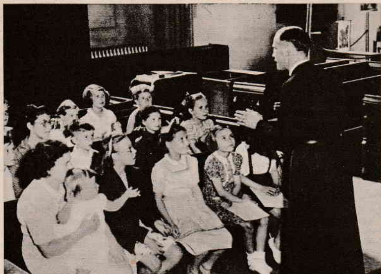
"First I Learn to Believe"