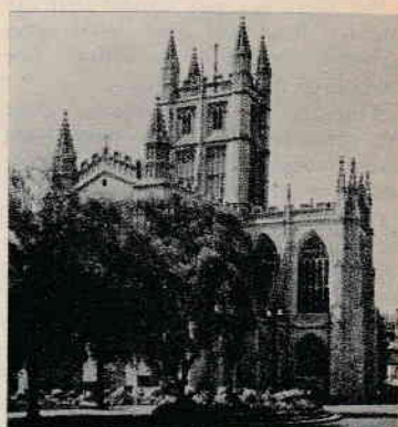
Bath Abbey—after recent restoration