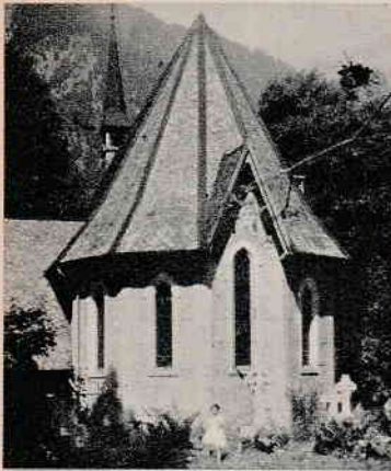
The English Church—Chamonix