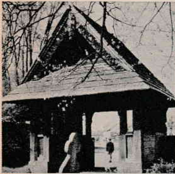
The Lych Gate—Aston-on-Trent