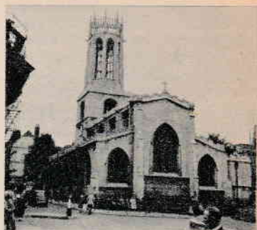
All Saints', Pavement, York

people of Oxborough, Norfolk, see this aim accomplished? Through the centuries our parish churches have served as silent witnesses of the Christian Faith, calling men to offer themselves to their Master; and inspiring them to go from the altar to do His will in hospital and workshop, school