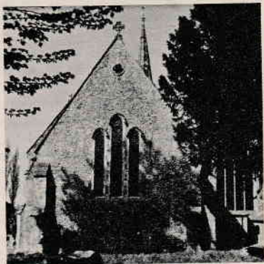
St. Martin's, Salisbury

of the Historic Churches Preservation Trust (Fulham Palace, London, S.W.6). Its aim was to help the parishes in raising the £4,000,000 required over the next decade to repair our 10,000 historic churches,